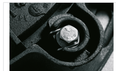
PAMTIGHT manhole covers - Anti-rotation clips

The information on this sketch is, to the best of our knowledge correct at the time of printing. However Saint-Gobain are constantly looking at ways of improving their products and services therefore reserve the right to change without prior notice, any of the data shown. Any orders placed will be subject to our Standard Conditions of Sale, available on request.