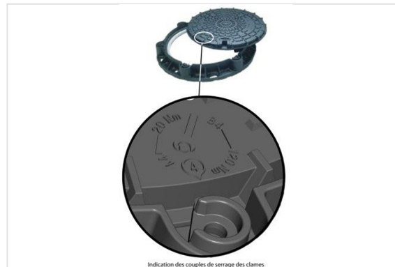
Torque for clamping claws