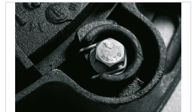
PAMTIGHT manhole covers - Anti-rotation clips

The information on this sketch is, to the best of our knowledge correct at the time of printing. However Saint-Gobain are constantly looking at ways of improving their products and services therefore reserve the right to change without prior notice, any of the data shown. Any orders placed will be subject to our Standard Conditions of Sale, available on request.