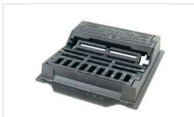
Gully units SELECTA 500 and MAXI C250 - Implementation

The information on this sketch is, to the best of our knowledge correct at the time of printing. However Saint-Gobain are constantly looking at ways of improving their products and services therefore reserve the right to change without prior notice, any of the data shown. Any orders placed will be subject to our Standard Conditions of Sale, available on request.